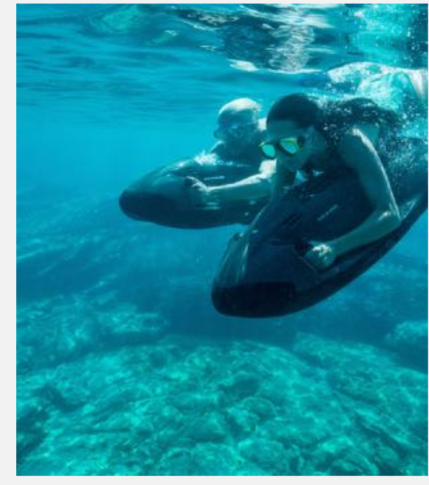
UNDERWATER TOYS - 2 SEABOBS