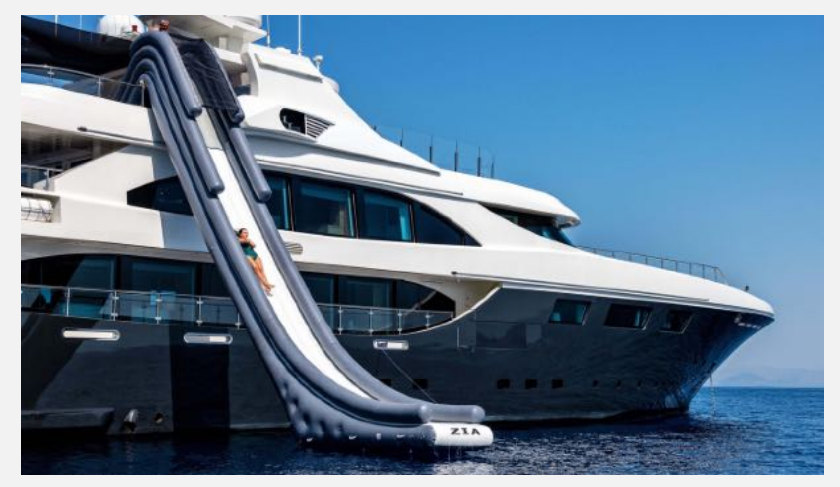
EXHILIRATING FunAir Sundeck Slide